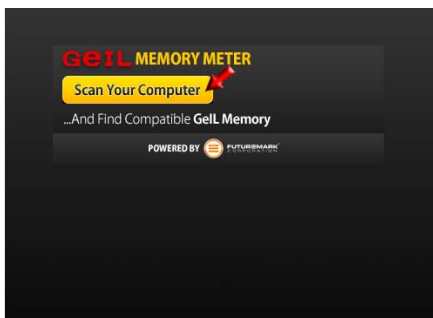
Step 1: Click on the “Scan Your Computer” button (red arrow).

Follow the easy instruction, to use the GeIL Memory Meter is as easy as 1,2,3: