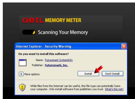
Step 2: Click on the “Install” button (red arrow).